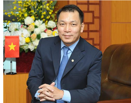
H.E. Dang Hoang An Vice Minister of Ministry of Industry and Trade