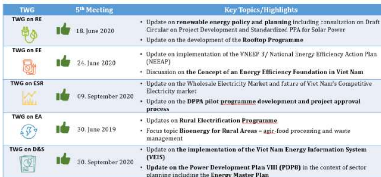
Table 1 – TWG meetings in the reporting period

Highlight: support to the implementation of the Viet Nam Energy Information System and the development of the TIMEs, Balmorel modelling, Technology Catalogue for Power Generation and Storage supported by Denmark as input to the Power Development Plan VIII