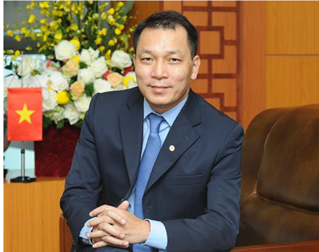
H.E. Dang Hoang An Vice Minister of Ministry of Industry and Trade