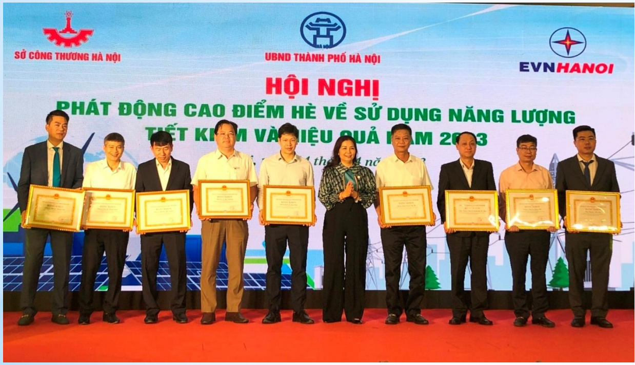
The organization awards certificates of merit to collectives and individuals with achievements in energy conservation

Annually, the Project Management Unit holds a meeting for summary, lessons learnt, and reward for groups and individuals with outstanding achievements in economical and efficient use of energy.